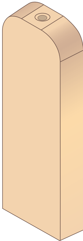
■ Vista cara principal